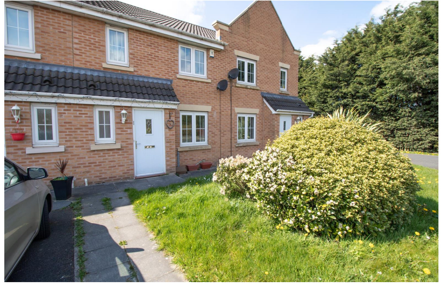
Owsten Court, Horwich, Bolton, BL6 5HL